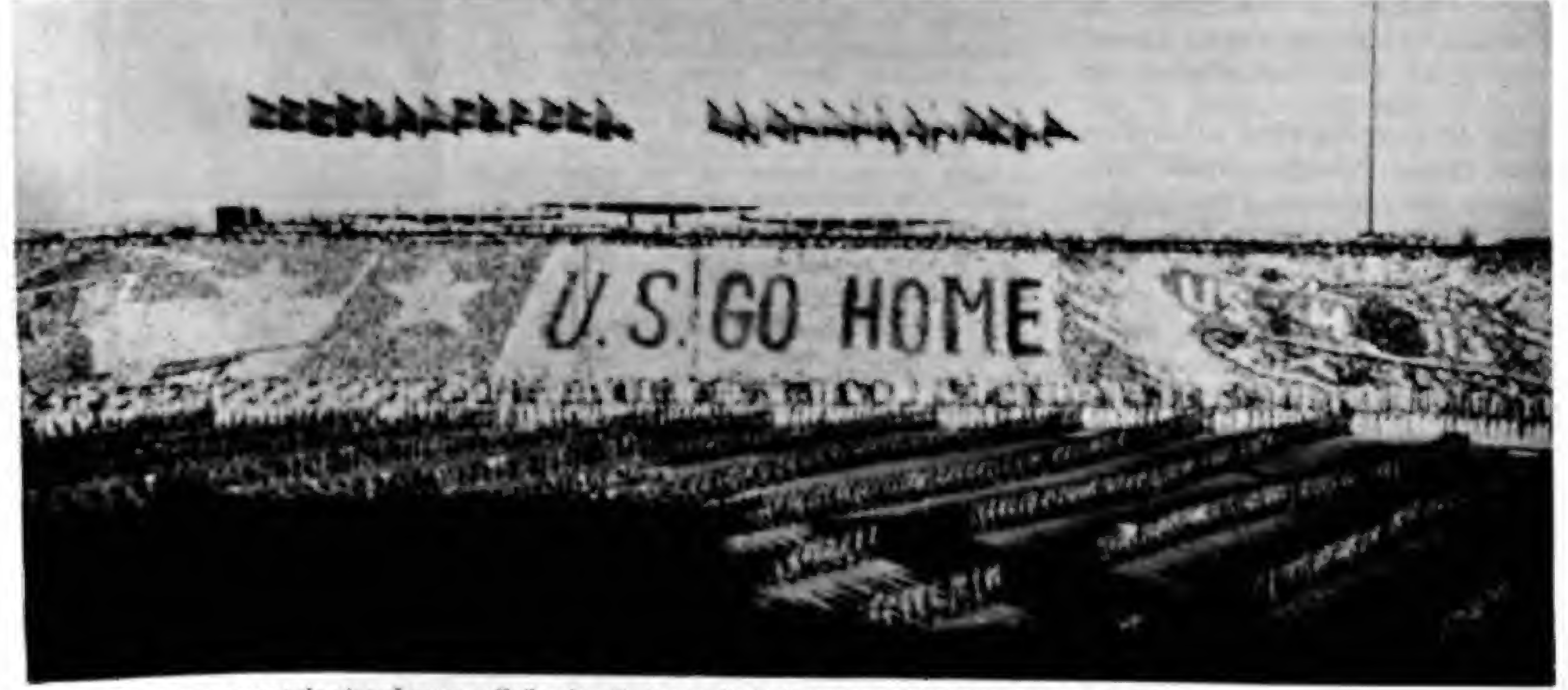
Cambodian young people staged mass calisthenics displays called "Prosperous Cambodia Forges Ahead", including this scene showing the Vietnamese people's determination to defeat the U.S. aggressors.

The First Asian GANEFO was a clear mark of the power and determination of the Asian people in their opposition to U.S. imperialism. Even as the Games were announced, the International Olympic Committee and other reactionary international sports organizations under the control of U.S. imperialism began frantically trying to prevent the sportsmen of some Asian countries from taking part. They used "warnings", threats of "disciplinary measures" and "suspension of membership" from sports organizations. When these tricks failed, the U.S. imperialists tried others. On the eve of the Games, they got Israel to demand that Cambodia not send an invitation to the Palestinian athletes. They attempted to confuse public opinion and sow discord among the Asian peoples by spreading the lie that Israel had been invited to take part in the Games. Cambodia exposed the U.S. imperialists' plot and